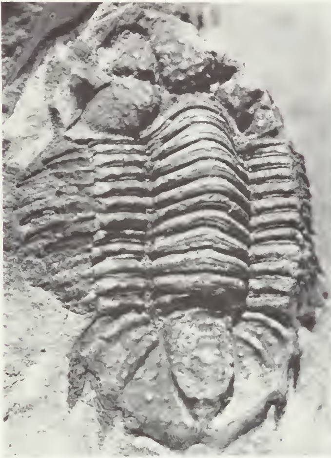
1. Complete carapace, Syme's Quarry, Killara, \times 4 .