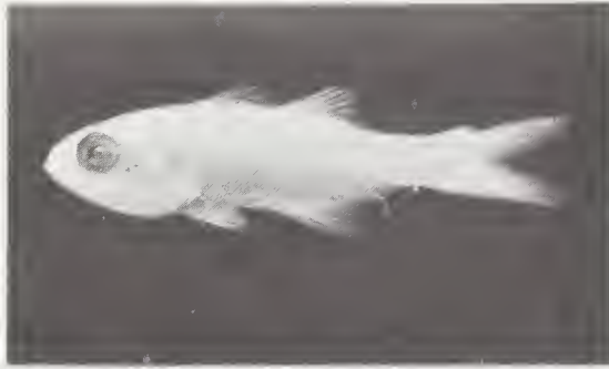
Figure 2. Rhabdamia eremia , holotype (WAM P25815-002), 37.5 mm SL, South Murion Island, Western Australia.

Colour in life: head with light brown or reddish pigmentation on snout and cheek, operculum silvery; body semi-transparent with silvery abdominal region; fins clear.