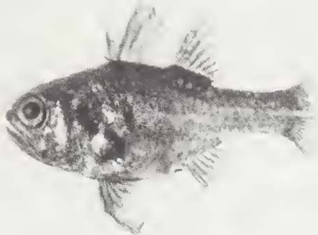
Figure 3. Vincentia badia, paratype (WAM P27643-009), 47.1 mm SL, Geographe Bay, Western Australia.

(1.6-1.7), of pelvic fin 1.3 (1.1-1.5), maximum height of second dorsal fin 1.7 (1.7-1.9), of anal fin 1.9 (1.8-2.1), all in head length.