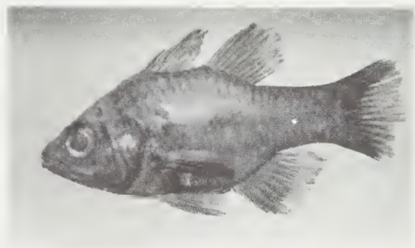
Figure 1. Apogon pallidofasciatus , holotype (WAM P2898 5-001), 100.3 mm SL, North West Cape, Western Australia.

Material examined. Holotype. Western Australia, Tantabiddi