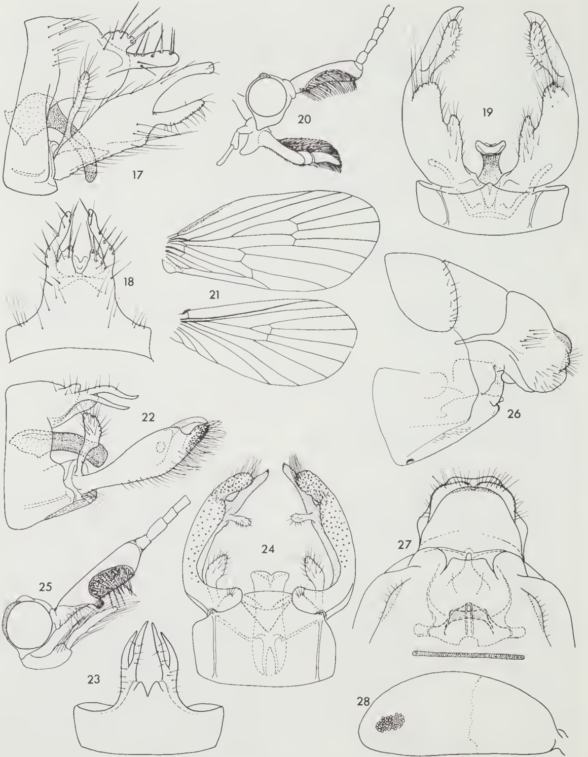
Figures 17–21. Goerodes xylochus sp. nov., PT-1540: 17, male genitalia lateral. 18, dorsal. 19, ventral. 20, male head lateral. 21, wing venation. ▶