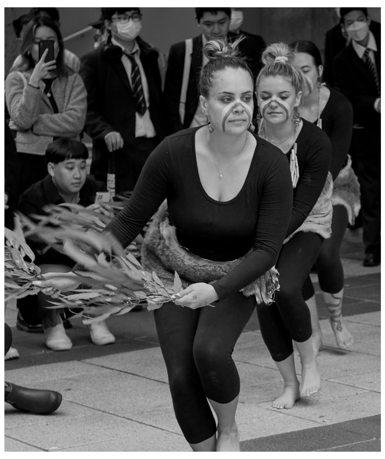
Djirri Djirri Dancers performing at Melbourne International Student Week, Immigration Museum

Our organisation, in partnership with the First Peoples of Victoria, is working to place First Peoples' living cultures and histories at the core of our practice.