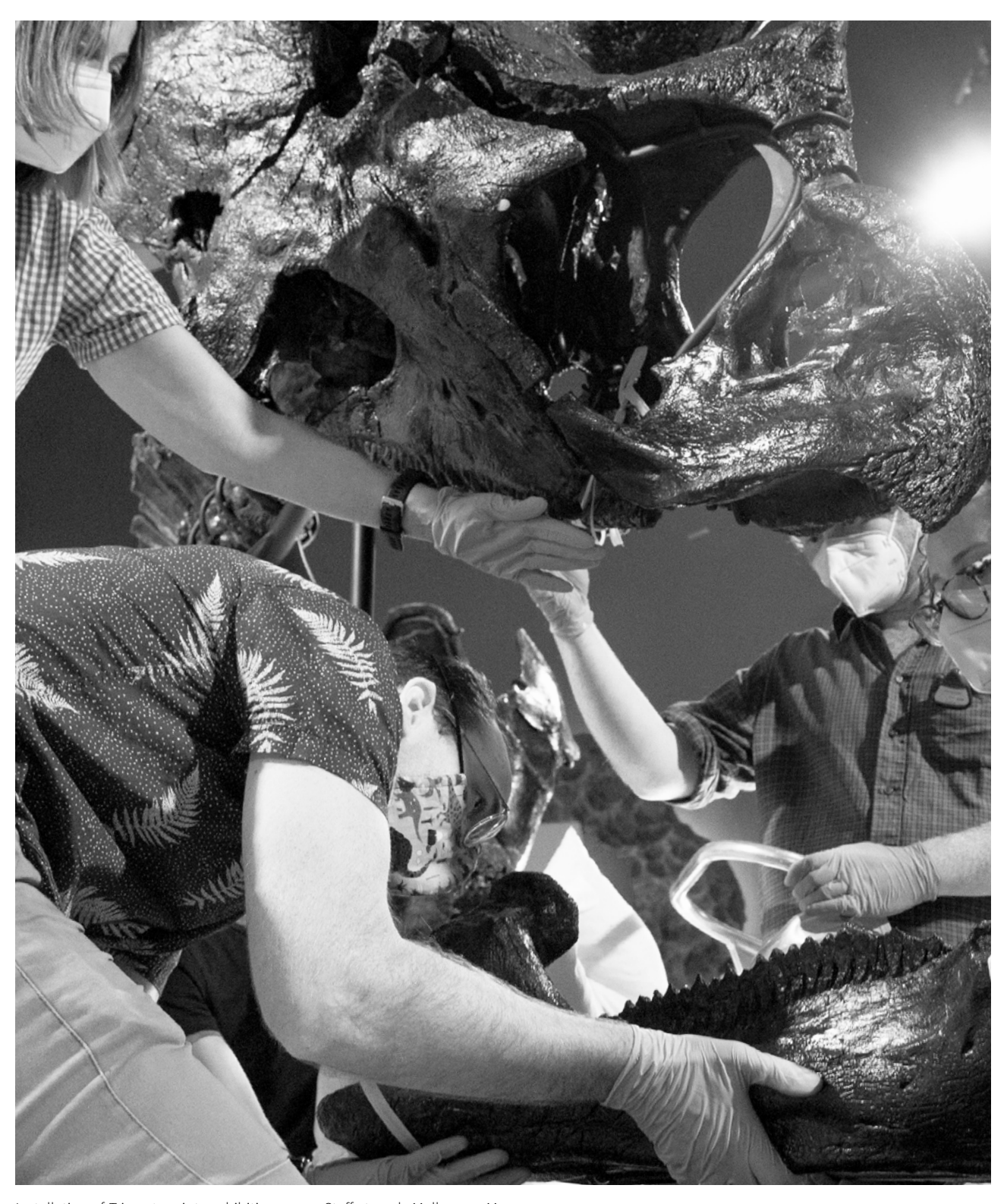
Installation of \it Triceratops into exhibition space: Staff at work: Melbourne Museum

Museums Victoria is Australia's largest public museum organisation. Founded in 1854, we are the major custodian of the State collection of scientific and cultural heritage, an invaluable record of Victoria's history. Our museums present unique and exceptional experiences for audiences worldwide to be inspired, to discover and to learn about themselves and the world we inhabit.