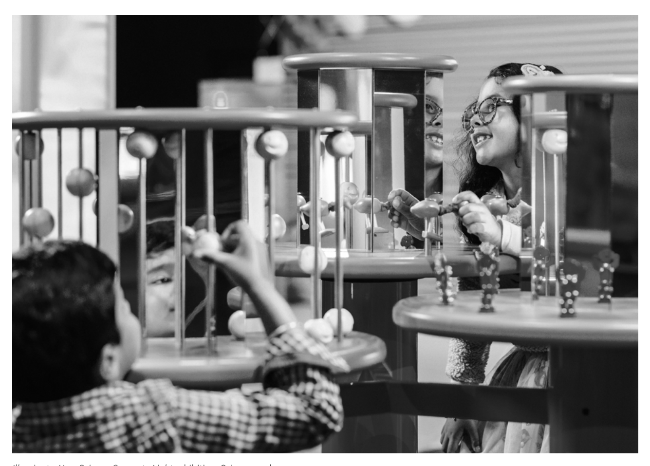
Illuminate: How Science Comes to Light exhibition, Scienceworks