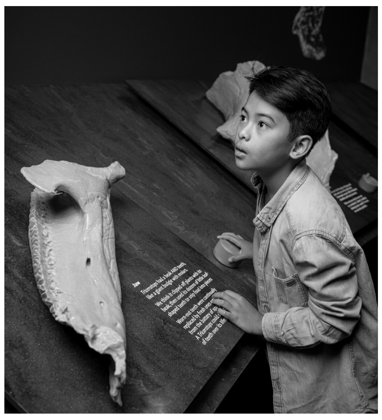
Young visitor interacting with \it Triceratops exhibition, Melbourne Museum