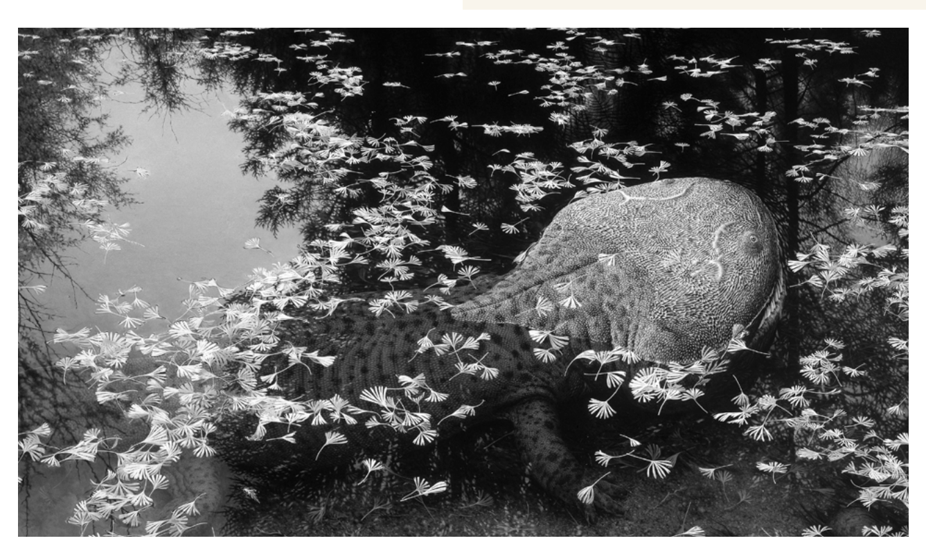
Illustration of Koolasuchus cleelandi in Early Cretaceous period, South-eastern Australia Source: Museums Victoria | Artist: Peter Trusler