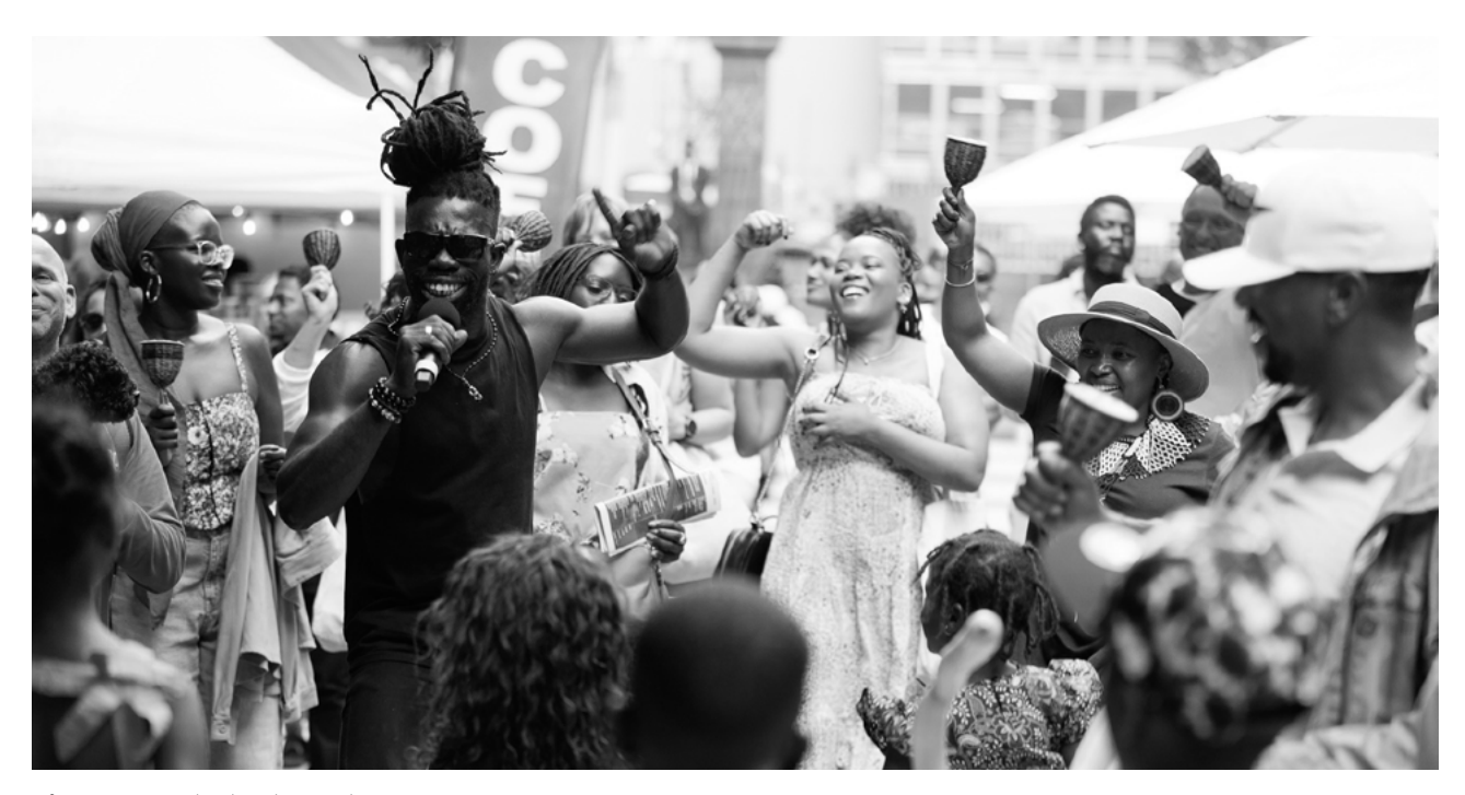
African Music and Cultural Festival, Immigration Museum