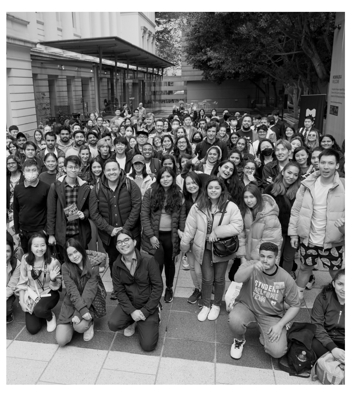
Students gathered in the courtyard for Melbourne International Student Week, Immigration Museum