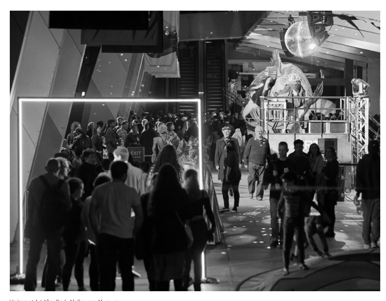
Visitors at Art After Dark, Melbourne Museum