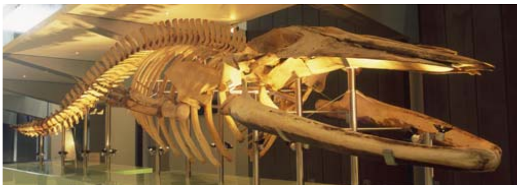
Blue Whale exhibit; Photographer Rodney Start.

Look at the Blue Whale skeleton in the entrance hall.