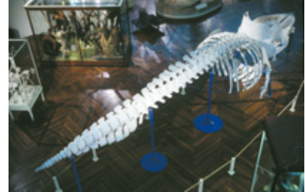
Sperm Whale skeleton

In the Marine Life exhibition, look for the whale skull.