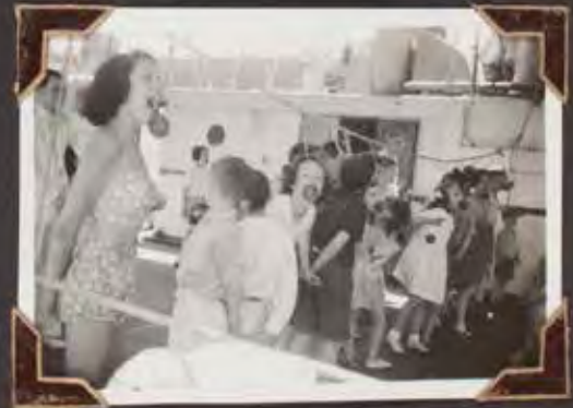
Biting the elusive apple.