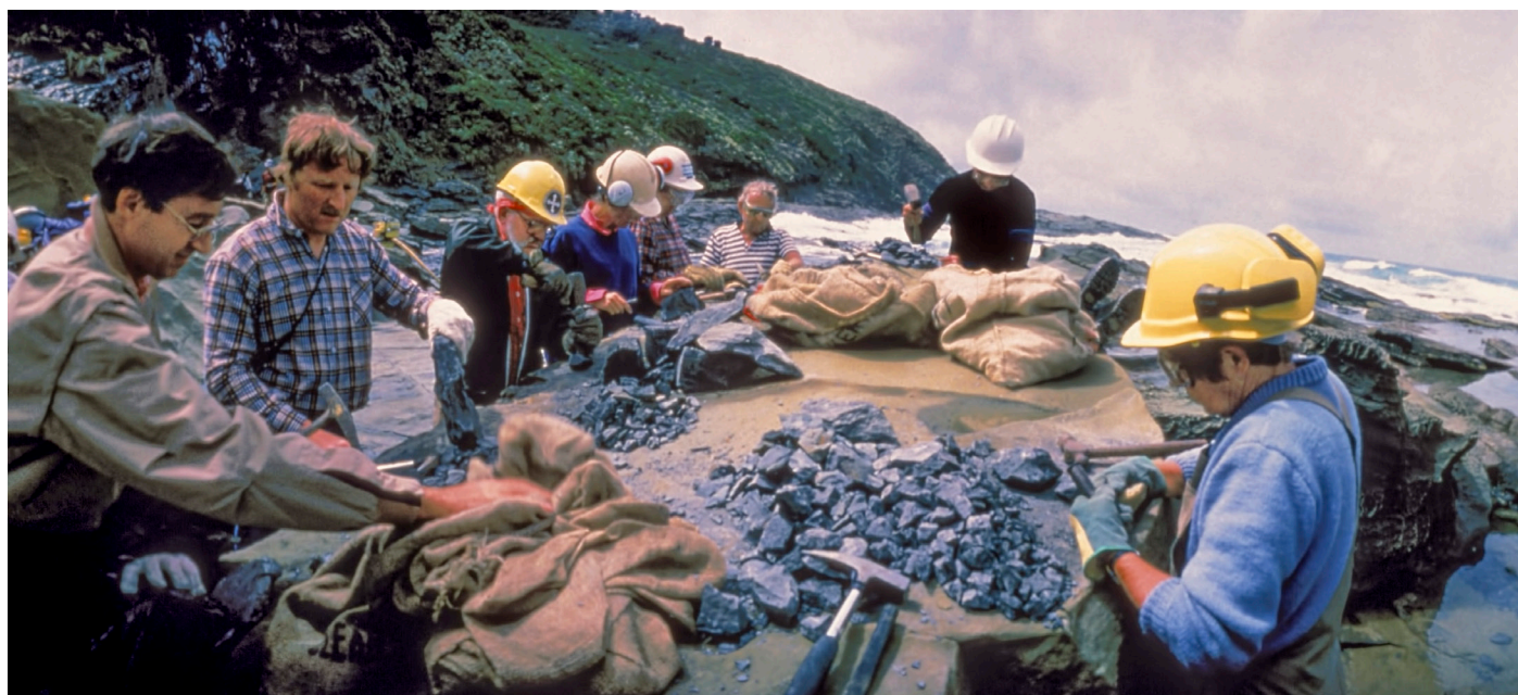
Fig. 1. Volunteers breaking up fossiliferous rock in the search for the all too elusive fossils of polar dinosaurs and the animals that lived alongside them.

This size is the cut off because one of the most significant components of the fossil assemblages are the remains of tiny mammals that rival living shrews in size. In addition, many of the pieces of dinosaur bones that are found are only slightly larger than the mammals.