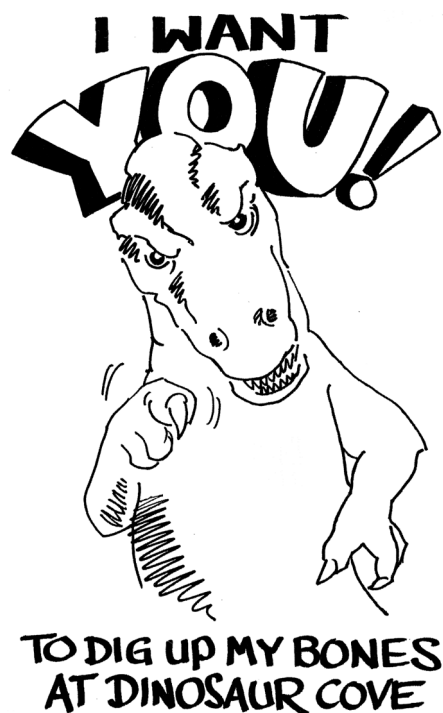
Fig. 3. Recruiting poster seeking volunteers to help with the excavations at Dinosaur Cove, the first of the three principal sites worked on the Victorian coast between 1984 and 2019, to find dinosaurs and the other animals that lived alongside them.

Beginning in 1978, fossil-bearing rock has been collected from the narrow shore platforms facing the Southern Ocean on the south coast of the State of Victoria. Three principal sites have been worked for more than a decade each. Extracting the hard, fossiliferous rock in the first place has been done by these same people in a variety of ways, depending on the circumstances of each site.