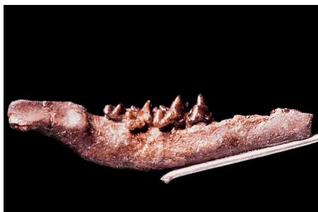
Fig. 12. Holotype of the fossil that Nicola found, Ausrtribosphenos nyktos , after it had been removed from the walnut-sized rock.