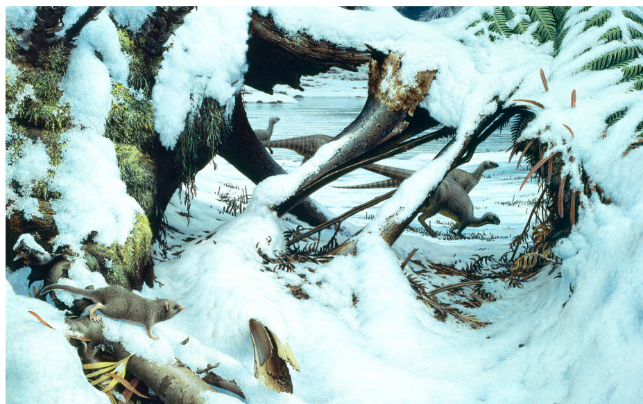
Fig. 15. If a single image can summarise what all the effort by The 700 has led to, it is this painting by Peter Trusler, depicting a winter scene in polar south-eastern Australia during the late Early Cretaceous.